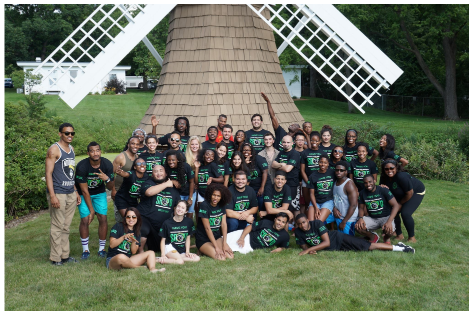
Pictured Above: Summer 2014 SROP Cohort

Now in its 30th year, 610 program alumni have earned Ph.D. degrees and are preparing the next generation of SROP scholars as mentors and teachers. Thousands of others have completed graduate training and are pursuing successful careers in government, business, and non-profit agencies.